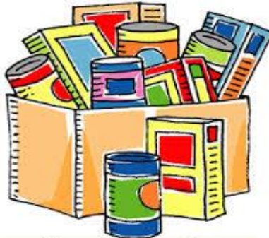
Feeding the Community

Please, the food bank needs our help. Bring as much food as you can to each service to be blessed and it will be taken to our food bank! Thank you!