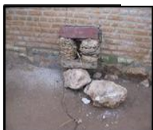
Homemade Welder in Rwanda