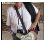
Bonnie in a field of metal welding supplies