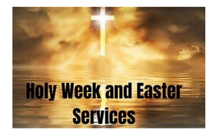
Today - The Sunday of the Resurrection: Easter Day St John's Port Rowan 10 a.m. and St John's Woodhouse 11:30 a.m.